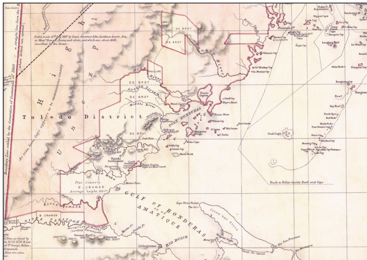
Figure 2. Usher's map (1891) showing private properties in southern Belize. Note that the interior of the Toledo District is marked 'unexplored'. As in the 1885 map, representation of the mountains of the mountains—drawn “As seen from Cayes” (the coast)—is inconsistent with local topography.

But there were plenty of Indigenous people in southern Belize. Many Garifuna people had settled in southern Belize by 1802 and another group arrived in 1832 (the event celebrated by “settlement day”). 40 And although their population declined due to Spanish reducciones and slave raids, Maya people have lived in the area known today as southern Belize for thousands of years. 41 There is now an abundant literature documenting the presence of Maya people in the interior of southern Belize prior to the 1880s; drawing from diverse sources, a group of scholars have documented linguistic, archival, oral-historical, geographical, and other lines of evidence indicating an unbroken history of Maya occupation of southern Belize. 42 Yet this literature has been imprecise about the historical geography of the earliest local British state institutions. Hoffman's study of the historical production of colonial territory is a landmark contribution in this respect, but here too the treatment of southern Belize is relatively weak. 43