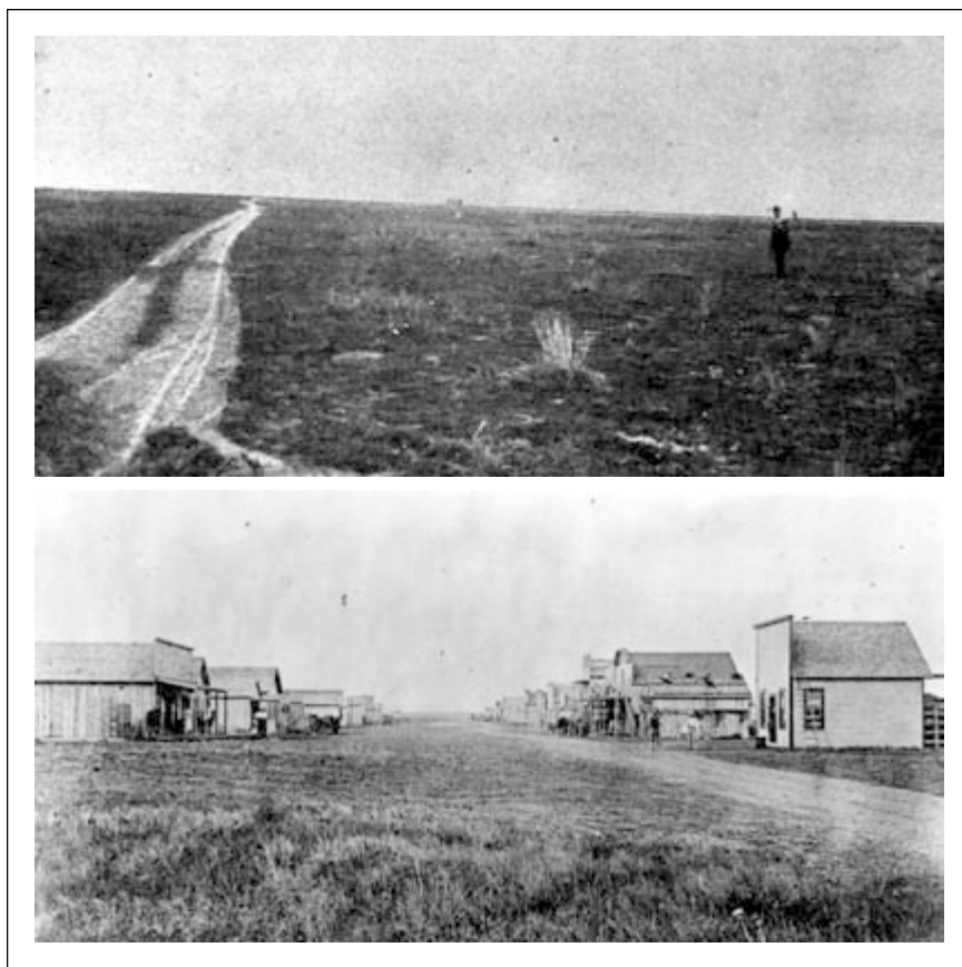
Figure 1. The area upon which Norman, Oklahoma, was settled before it was opened to homesteaders in 1889 (top), and Main Street two months after the land run.

arboriculture on the rural Great Plains, remarkably little research has been conducted on tree planting in cities and towns. This study seeks to fill that gap by using one town as an example of the crucial role tree planting often played in urban development and the making of place in the grassland biome.