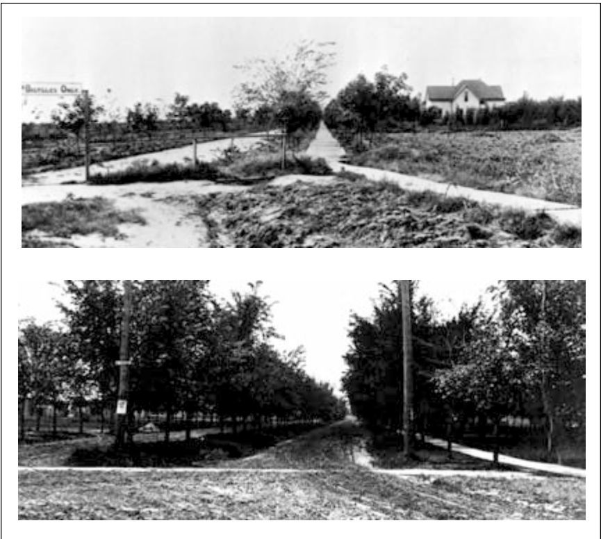
Figure 7. University Boulevard as it appeared in the 1890s (top), and several years later.

Trees became increasingly important to the image of the university and the town, and played an integral role in promotional efforts. University catalogs included detailed descriptions of the campus. Photos sent by the university to newspapers and magazines emphasized the shaded lanes, and groves of