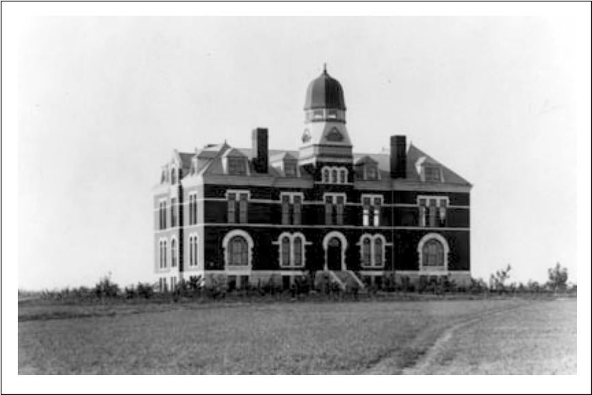
Figure 2. The first building at the University of Oklahoma, standing in a grove of newly planted elms shortly after its completion in 1893.

western New York state, the imprint of developers and early settlers can be “pervasive and enduring.” 2 The landscape Boyd and others created in Norman in the years before Oklahoma became a state in 1907 established a template that subsequent generations, seeking to maintain the sylvan environment, have followed.