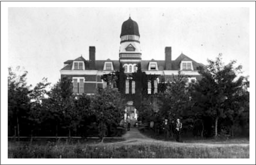
Figure 4. Elm and maple trees create a dense growth around the first university building in 1900. Compare this view to that in Figure 2.

Boyd continued to plant trees every spring and fall and the campus nursery grew progressively larger. In 1897, more than 2,000 trees were planted on campus and the following spring, 13,000 trees were set out. The Transcript estimated in 1898 that the young trees growing in the nursery numbered 40,000. By this time, the grove of elms planted around the university building in 1893 had become so dense that only the top of the building was visible (Figure 4). The elms planted along University Boulevard had also grown con-