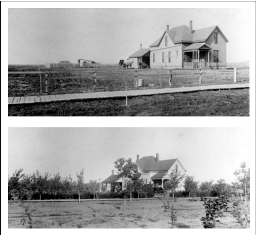
Figure 6. Elm seedlings planted along the sidewalk in front of the university president’s home in 1895 (top), and after they had grown considerably.

Photographs and descriptions of the town and campus illustrate how thoroughly tree planting transformed Norman. A photo of the president’s home taken in 1895 (Figure 6) shows a few leafless seedlings, three or four feet tall, in front of a frame house. In a photo taken 16 months later, the trees have grown considerably and nearly all have abundant foliage. In a third image, taken about 1898, the president’s home is barely visible amid the flourishing elms. The Santa Fe Railroad included a sequence of three such photos of the president’s home in a booklet it published to promote settlement in Oklahoma, no doubt to dispel the notion that trees would not grow in the area. 33