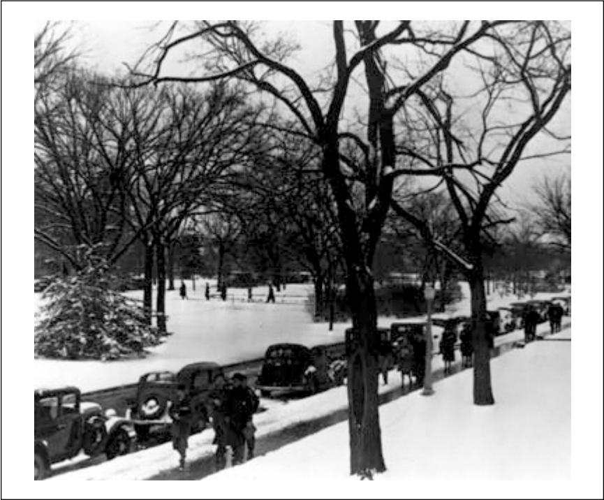
Figure 9. The picturesque north oval of the University of Oklahoma, blanketed by snow in the 1930s, exemplifies the dramatic transformation of the campus by trees.

no buildings at the university are named for Boyd, a tree planting project on the campus in the 1970s bore his name. He is also frequently mentioned as an inspiration for a renewed interest in trees and landscaping on the campus in recent years. 37